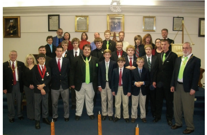
Degree teams and Candidates at Lexington

Lodge, to whom we wish to issue special thanks. On behalf of the Virginia State Association we wish to welcome our new brothers to our order and also may you find both happiness and joy in your fellowship in DeMolay.