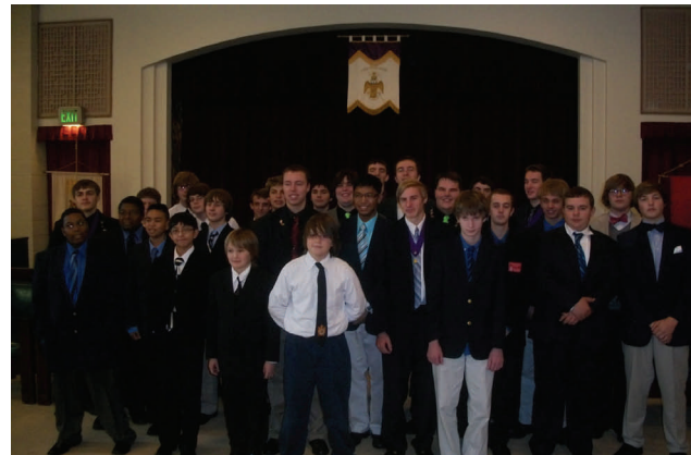
Eastern Region Initiatory Degree Team on November 28th